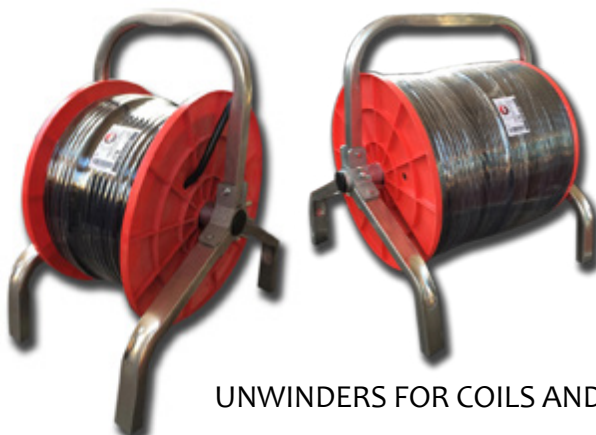
UNWINDERS FOR COILS AND BOBBINS