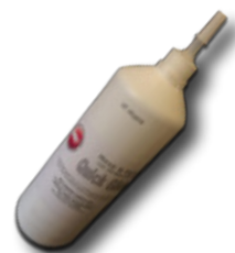
CABLE PULLING LUBRICANT