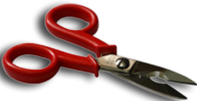
SPECIAL COAX SCISSORS