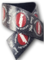
ADHESIVE REUSABLE VELCRO